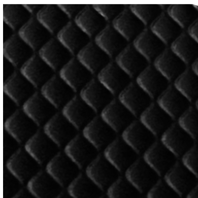
nero brillante brilliant black