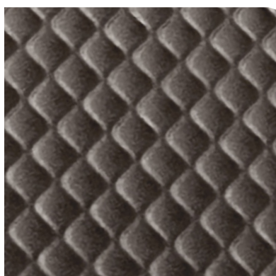
grigio lava lava grey