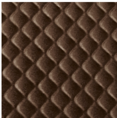
marrone brillante brilliant brown