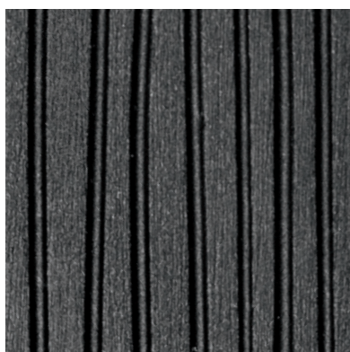
grigio lava lava grey