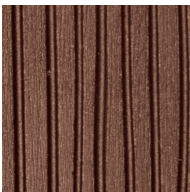
marrone ramato copper brown