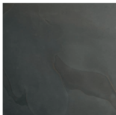
metallo nuvolato cloudy metal