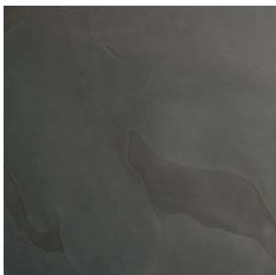
metallo nuvolato cloudy metal