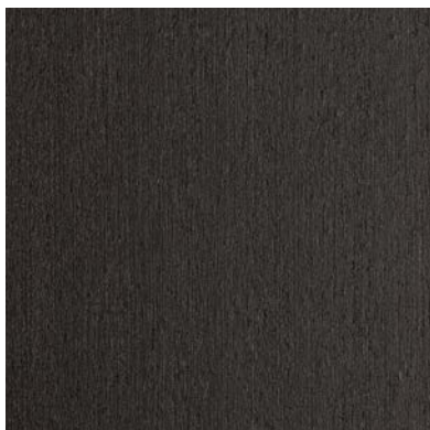
Nero poro aperto Open pore black finish