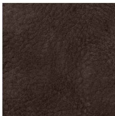
testa di moro 2114 dark brown 2114