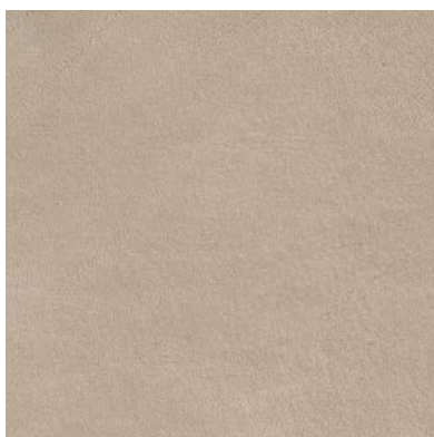
Perla 2118 Pearl grey 2118