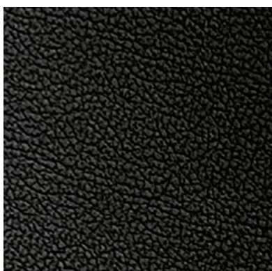
nero F04 black F04