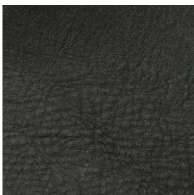
Lavagna 2138 Slate black 2138