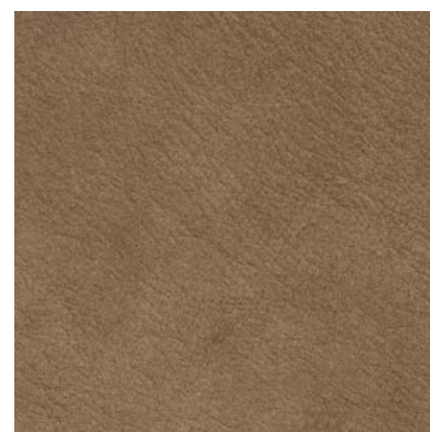
Castagna 2116 Chestnut brown 2116