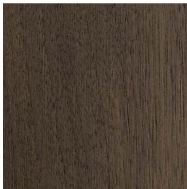
Tabacco Tobacco finish