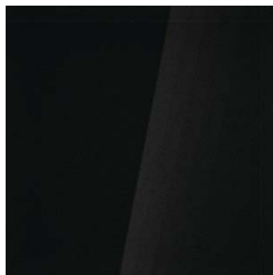
vetro Nero95 Black95 glass