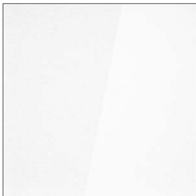
vetro extralight extralight glass