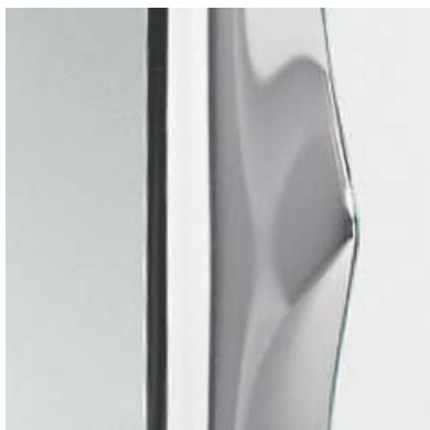
vetro fuso retroargentato back-silvered fused glass