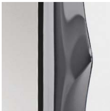
vetro fumé fuso e retroargentato Fused and back-silvered smoked glass